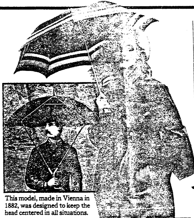
This model, made in Vienna in 1882, was designed to keep the head centered in all situations.

Umbrellas have a past at least 3,000 years old. In the West, its fictional inventor was Robinson Crusoe, in the novel by Daniel Defoe published in 1719. The umbrella that the shipwrecked hero cleverly fashioned for himself became so well known that later in the 18th century when umbrellas came into wide use, they were called Robinsons in England. Umbrellas are descendants of sunshades (parasols, from Latin, meaning to ward off the sun), and an ancestor of