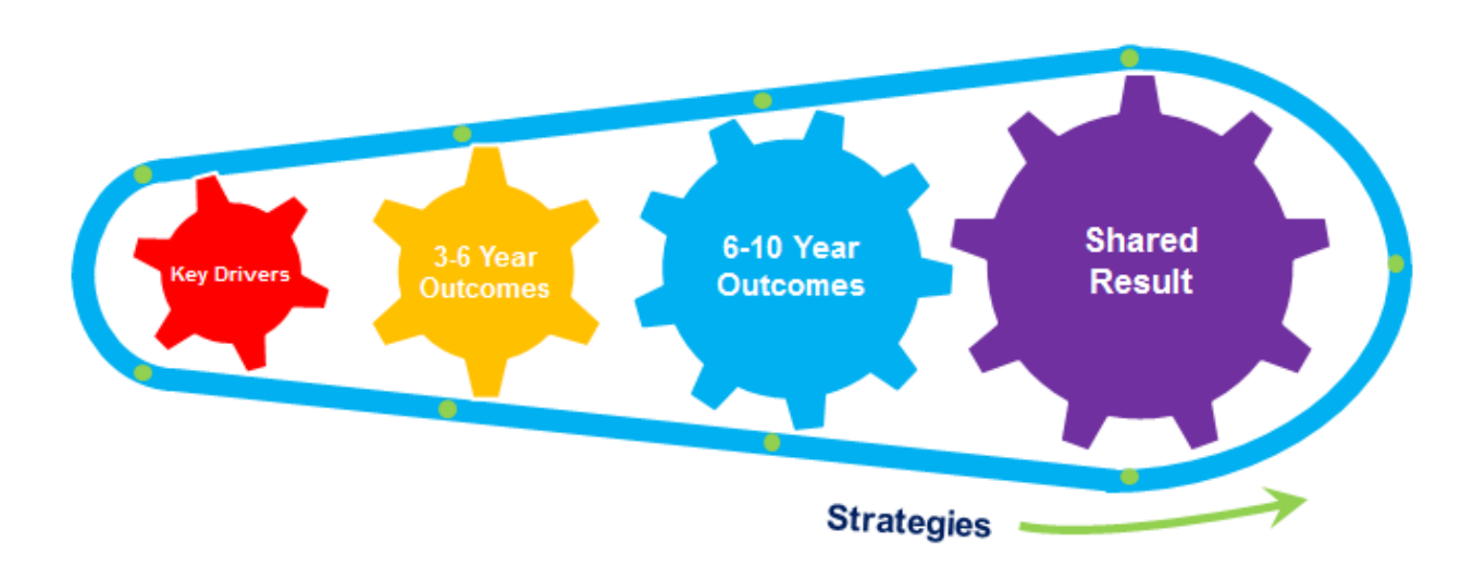
Figure 3. Data-Driven Feedback Loop.

population. The outcomes are divided up in to 3-6 year outcomes and 6-10 year outcomes to allow the collective impact initiative to think of its work in phases. Some progress can be seen early through changes in data, and some progress can only be seen after several years. Strategies are a coherent collection of activities, ideas and programs that drive changes towards a shared result.