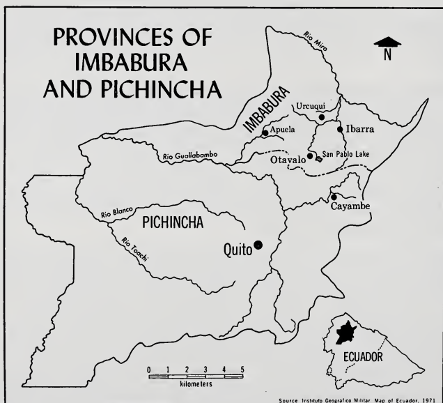
FIGURE 1. Archaeological sites near San Pablo Lake, Ecuador. Source of base map: Servicio Geografico Militar, Mapas Topograficos: Illuman, Otavalo and San Pablo sections. 1938.

There are four highland lakes in the Andes north of Quito: Mojanda; Cuicocha; Yaguarcocha and San Pablo. Lake Mojanda, at 3716 m, and Lake Cuicocha, at 3068 m, are probably too high to support very much early agriculture. Therefore, our efforts focused on San Pablo Lake (2661 m) (Fig. 1) which is well known for its modern Indian populations (1) as well as for its importance in the late prehistoric (4, 12) and early historic periods (11). Among other things, we hoped to establish the relationship between modern and prehistoric populations as an aid to archaeological interpretation. Other parts of the total study will include ethnographical and botanical research.