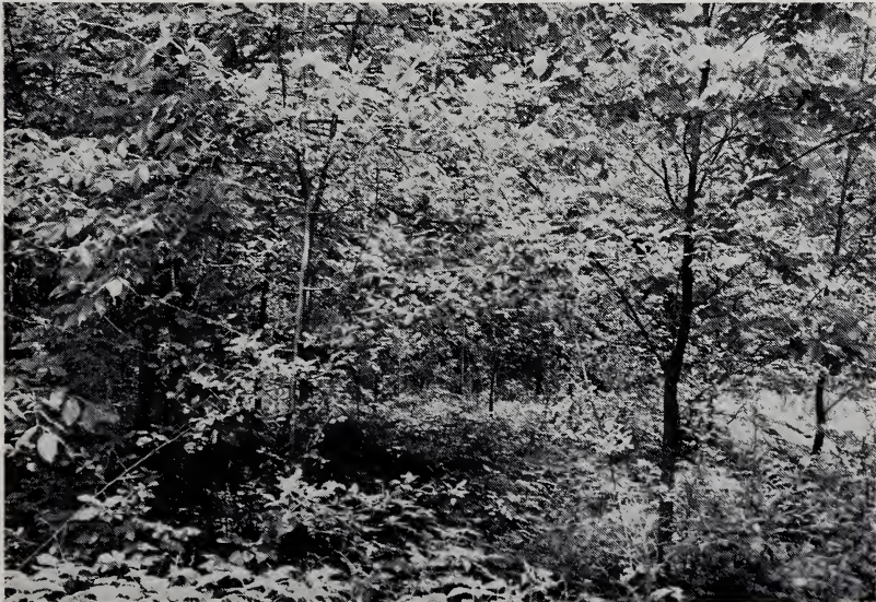
FIGURE 1. The Poa-Andropogon-Rubus Upland in 1950 (above) and 1971 (below), looking southward from the same marker stake.