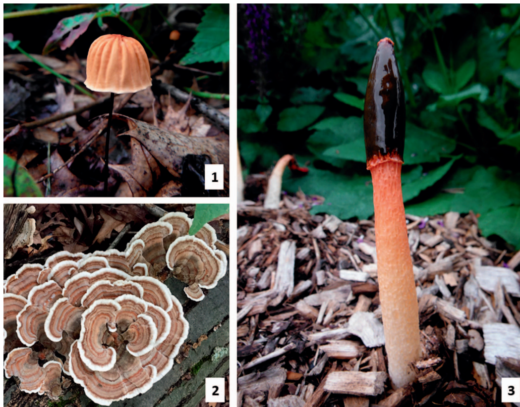
Figure 1–3.—Indiana macrofungi. A wide range of fungal diversity can be found within the state of Indiana, including macroscopic fruiting bodies recognizable as (1) mushrooms ( Marasmius sp.), (2) turkey-tail fungi ( Trametes sp.), and (3) stink horns ( Mutinus sp.).

is being made available online through the MyCoPortal ( http://mycoportal.org , see the Macrofungi of North America: Regions research checklist page), and will be updated regularly as more data become available.