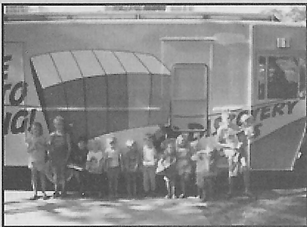
Daycare visitors to the Discovery Bus.