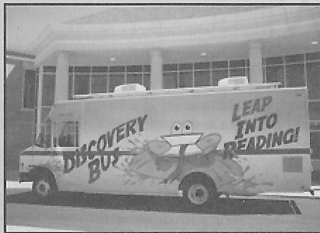
The Discovery Bus

Gardner began by calling some libraries that were given as references at the conference for the various vehicle vendors, and she e-mailed other libraries with questions about their bookmobiles. The committee traveled an hour's distance to see