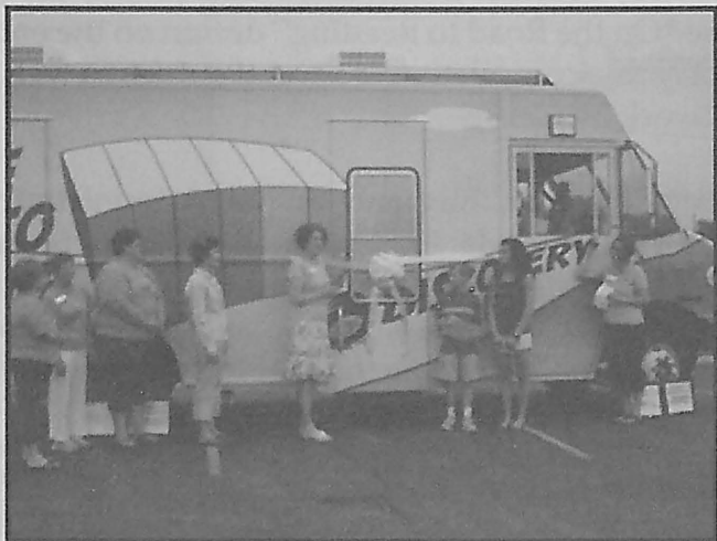
We used our public address system during the Discovery Bus grand opening at a fundraiser for the local child-care network and homeless shelter on June 7, 2008.

The disabled access and safety features are important aspects of the new vehicle. Customers appreciate the wheelchair lift, which makes it possible for disabled people to visit the Discovery Bus. We also use the lift to cart books on and off the Bus.