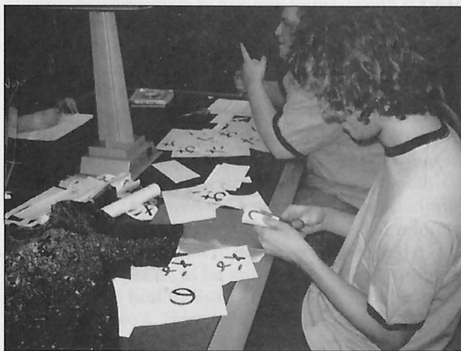
Two teens, one American and one Japanese, display the friendship they've developed from sharing an interest in manga.