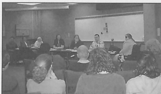
Above: Delta Sigma Omicron Officers and Sponsors at Initial Meeting