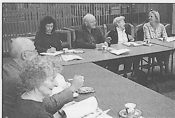
Friends Board Meeting

The Friends have sponsored many types of programs over the years that attract community and campus audiences to the University Libraries. One of the first activities that the Friends sponsored was the Annual Bracken Library Carol Sing (later known as