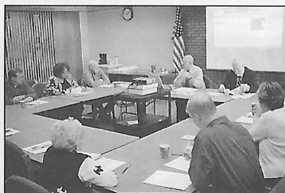
Friends Board Meeting